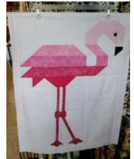
Flamingon Wall Hanger