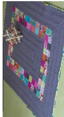
Modern Baby Quilt