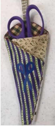
Paper Pieced Machine