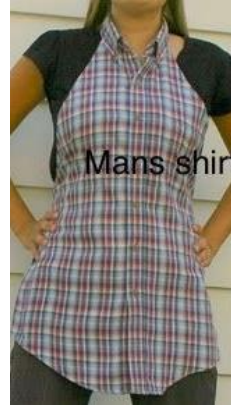
Apron from Man Shirt