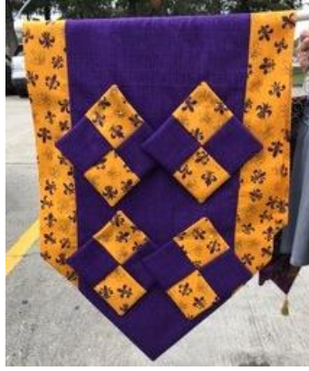
Table Runner & Coasters